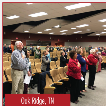
Oak Ridge, TN

10th Anniversary Official Cold War Patriots National Day of Remembrance™