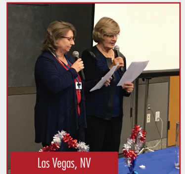
Las Vegas, NV