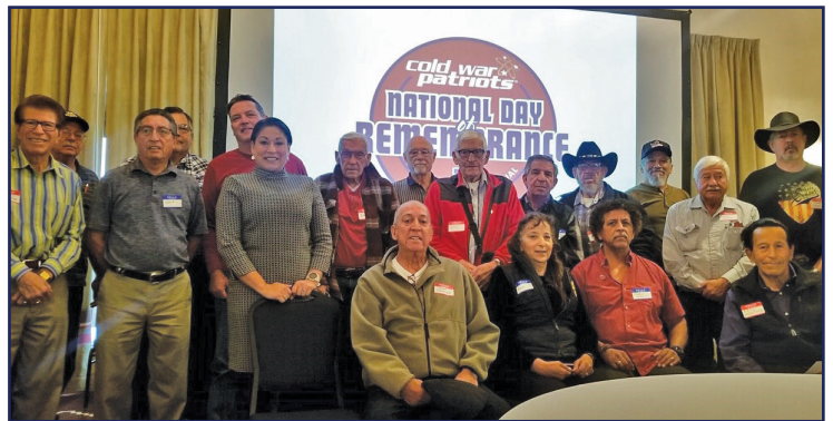
Cold War Patriots Living Legends in Española, New Mexico