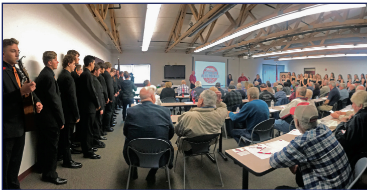
West High School Choir Performing in Piketon, Ohio