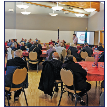
A Full Room at the Richland, Washington NDR Honoring Hanford Workers