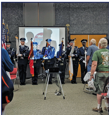
Nellis Air Force Honor Guard Posting the Colors in Las Vegas, Nevada