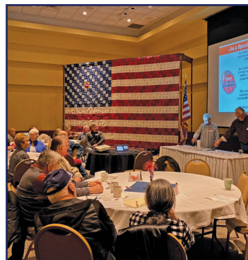
Reading of the Names & Lighting of Candles, Arvada, Colorado