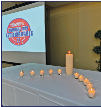
Eleven Candles Representing the Fallen Heroes from the Savannah River Site in South Carolina

May we all meet again next year for the 12 th Cold War Patriots Official National Day of Remembrance™.