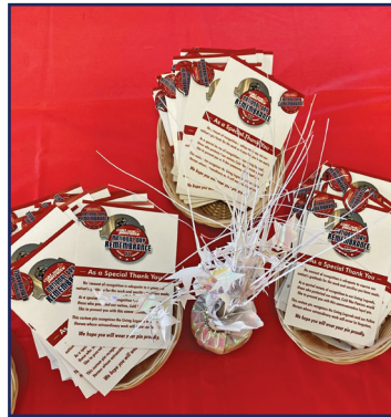
Living Legends Pins Ready to be Distributed to Cold War Patriot Members in Paducah, Kentucky