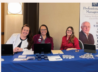
PCM Clinical Staff | Oak Ridge, TN