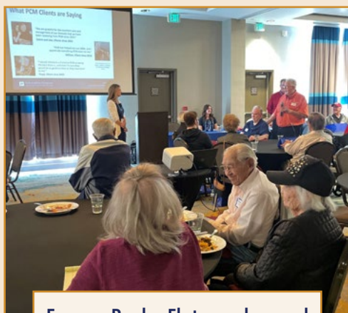
Former Rocky Flats worker and PCM Client sharing their advice Arvada, CO

We encourage all Cold War Patriots (CWP) members, especially first-time attendees and Professional Case Management clients, to attend an event. We offer a wide variety of event types, from Lunch & Learn educational events to fun social events and reunions. It's a great chance to learn about your benefits and reconnect with fellow workers. Pick up some CWP swag at the events too, including CWP hats, commemorative coins, compression socks, umbrellas, and much more!