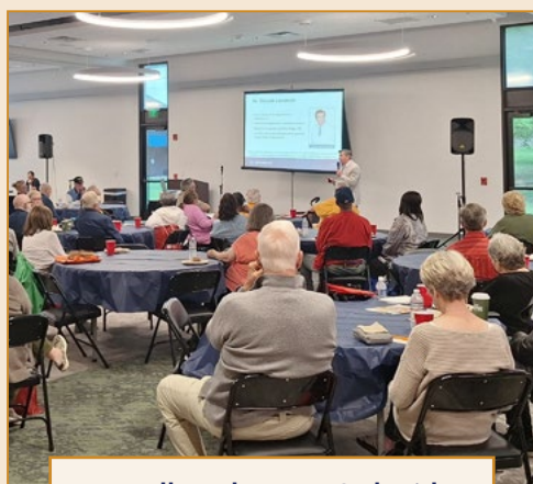
Doc Talk at the new Oak Ridge Conference Center Oak Ridge, TN