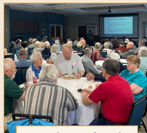
New Lunch & Learn focused on neurologic disease progression Richland, WA