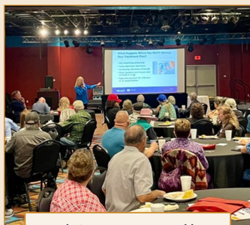
Lunch & Learn presented by a Certified Respiratory Therapist Albuquerque, NM